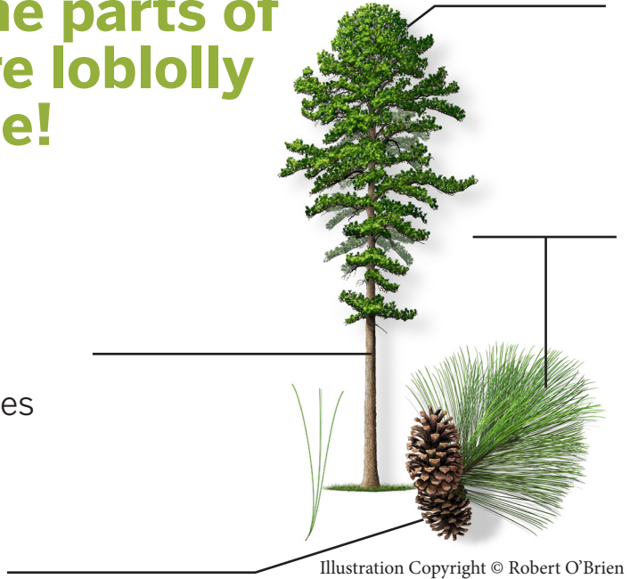
Illustration Copyright © Robert O'Brien