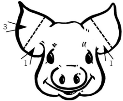
Litter 4, Pig 1

Litter Mark: The right ear is used for the litter mark. All pigs from the same litter must have the same ear notches in this ear. The right ear is on the pig's own right.