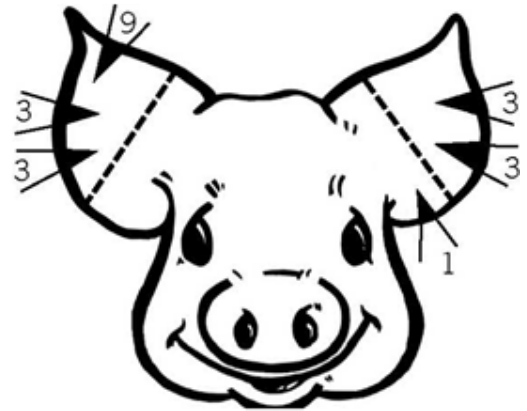
Litter 15, Pig 7

Litter Mark: The right ear is used for the litter mark. All pigs from the same litter must have the same ear notches in this ear. The right ear is on the pig's own right.